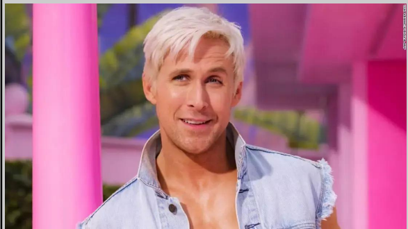
Ryan Gosling in his role as Ken