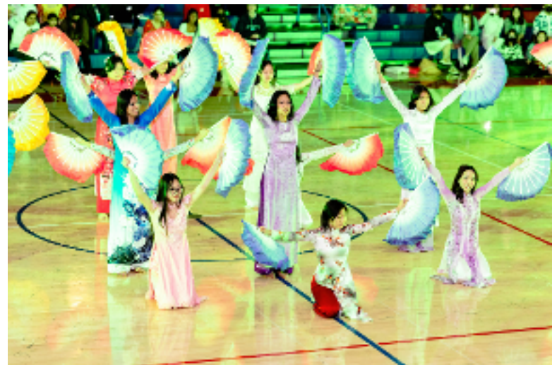
Colors fly high during VSA's vibrant performance