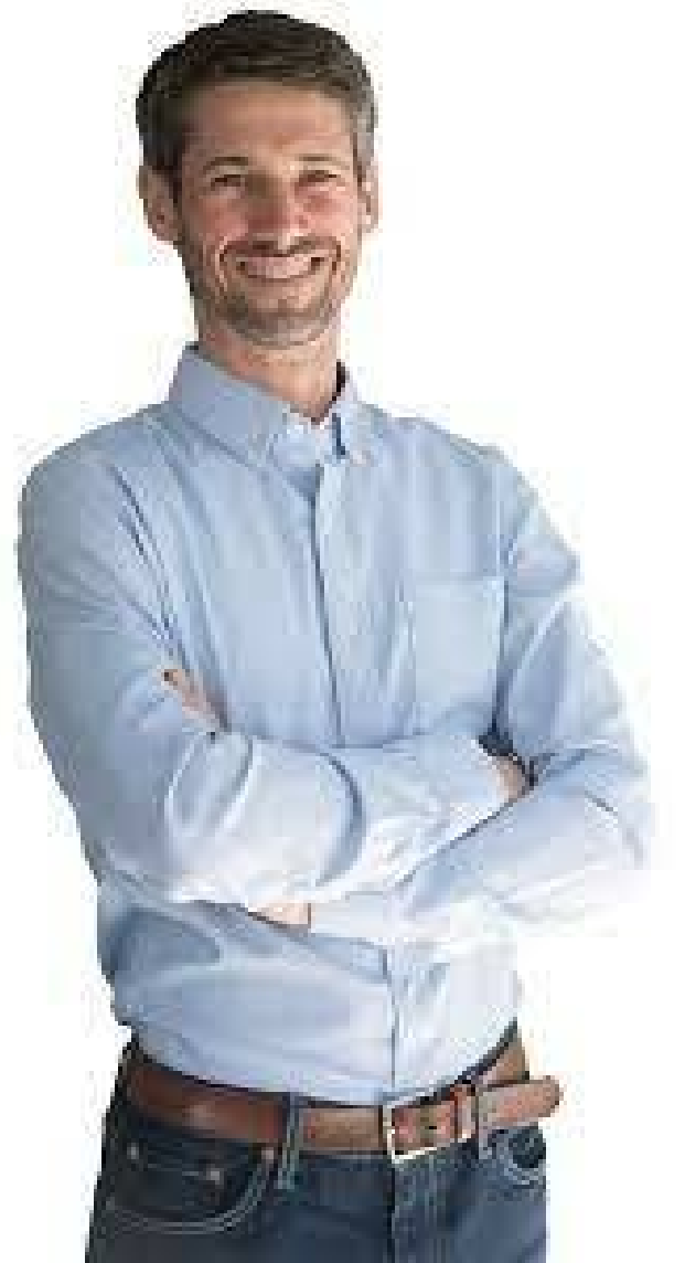
Matt Mahan, San Jose's new mayor

If you are interested in learning more about Mayor Mahan, visit www.mahanforsanjose.com .