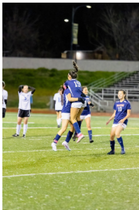
Soccer Girls cheering on the soccer field

The soccer season is almost coming to an end, the girls have put their blood, sweat, and tears into their performance this year. Let's hope for their next few games to be successful and give a round of applause to the team for their extraordinary game play and especially to the departing Seniors. We wish them the best of luck for their future!