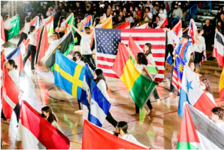
Students closing the show with the Parade of Nations

Multicultural Rally Shows Off Diversity, Positivity of IHS Students, Staff